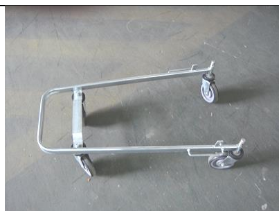
Assemble the wheels on the bottom frame