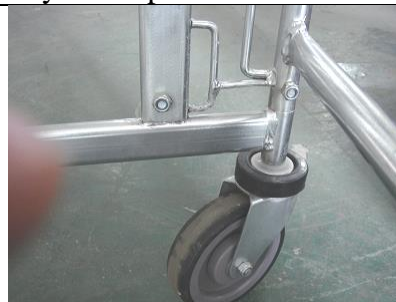
And attach with nuts on the inside