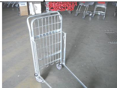
Fit top shelf vertically