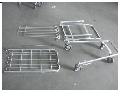
Layout all parts